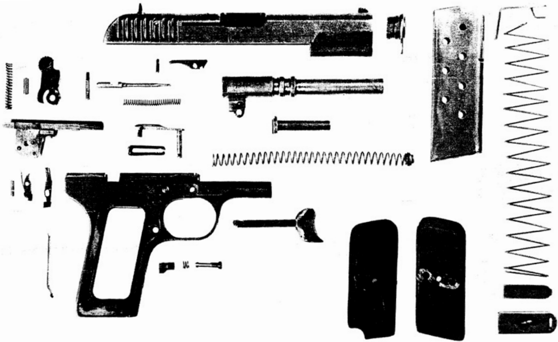
FIGURE 12-12. Disassembled view of a 7.62mm Tula-Tokarev 30-33 pistol.